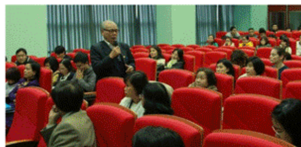
Elderly people are suggesting: "Services we need to help us at home and in the community"

The ending session of the workshop includes a workshop overview and panel discussion on how to use research to improve mental health, improving psychosocial support in cancer care with the active participants of community members, researchers, clinical doctors, and policy makers. We hope that the research findings can be applied to make a positive, practical difference in people's lives.