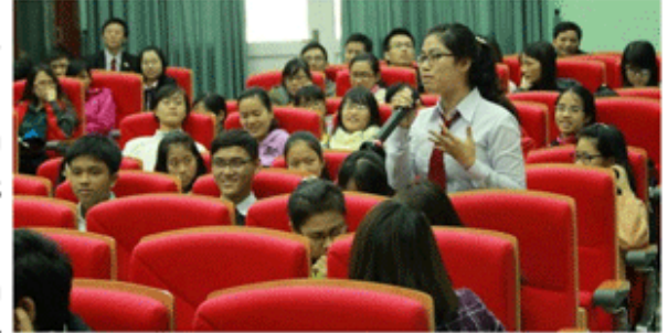
High School Students, talking about their experience of study burden during high school

During the two days of the 9th and 10th of January 2015, ICHR, Hue UMP has organized the workshop on 'Mental Health in Vietnamese communities. In this workshop, researchers from the ICRH at Hue UMP and colleagues from health and education organizations and sectors have presented the main findings from studies on the mental health of the communities among different age groups carried out in national and central Vietnam. The topics of research are very common issues, influencing many people at different age groups such as: academic pressure and its association with mental health among high school pupils, common mental disorders such as depression, anxiety disorder among medical university students, postnatal depression, mental health among cancer patients, dementia and depression among the elderly. The workshop also exchanged international